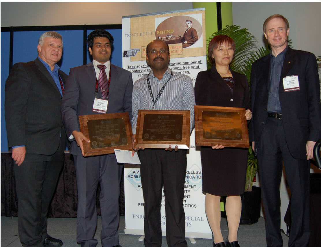
Figure 3. MUSCADE researchers were presented the best paper award at the ICCE 2011

"The paper proposes an object based coding approach for depth maps in 3D video based on 3-Dimensional Motion Estimation"