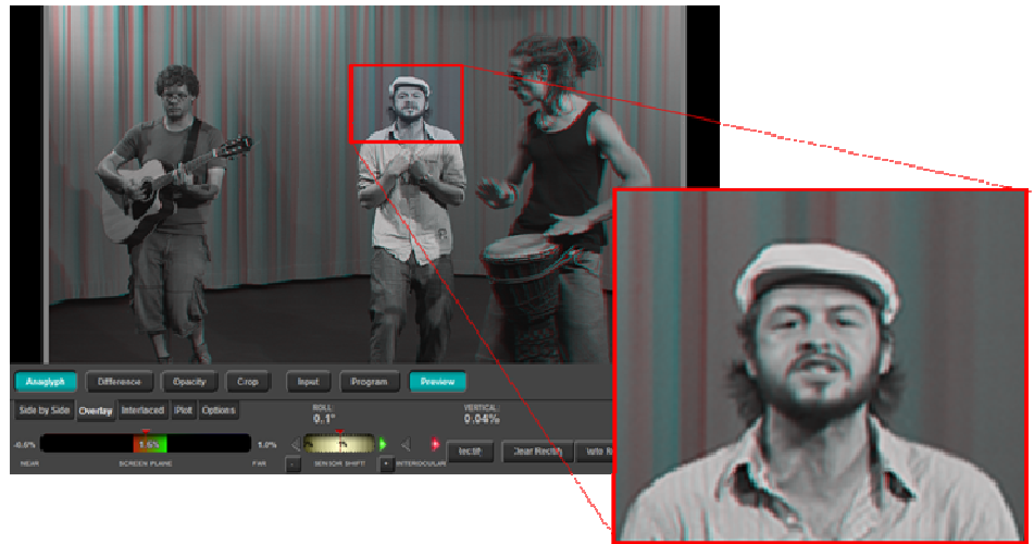
Figure 2. Screenshot of the assistance system used to calibrate the Multi-Camera Rig and perform the registration of all four cameras (remaining vertical disparities are eliminated)

[2] F. Zilly, M. Müller, P. Eisert, P. Kauff, "An Image-Based Assistance Tool for Stereo Shooting and 3D Production", in Proc. International Conference on Image Processing (ICIP), pp. 4029-4032, Hong Kong, China, Sep. 2010.